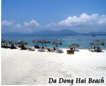
Da Dong Hai Beach