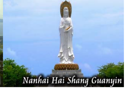
Nanhai Hai Shang Guanyin